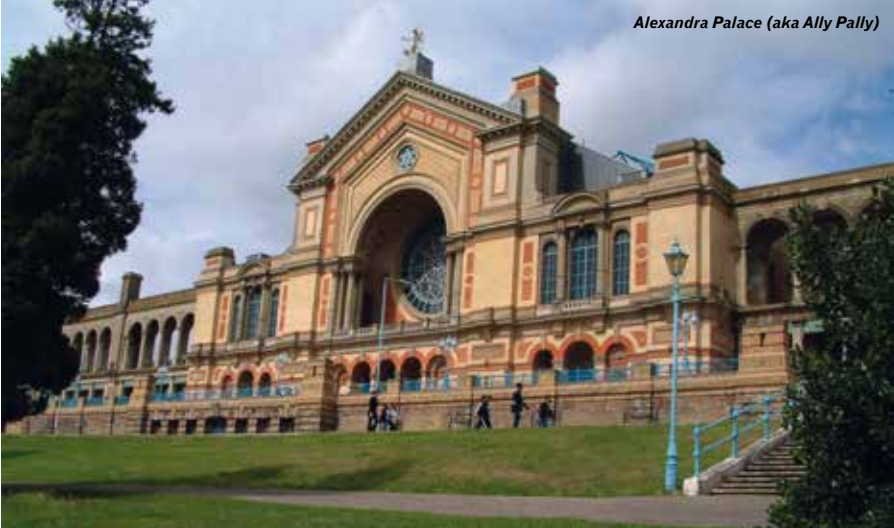
Alexandra Palace (aka Ally Pally)

top of a hill between Muswell Hill and Wood Green, there are spectacular wide panoramic views over London. The original purpose of the 'palace' was to serve as a public centre of recreation, education and entertainment. From 1936 to 1981, the BBC leased part of the building to use as the production and transmission centre for their new BBC television service. Today it remains as one