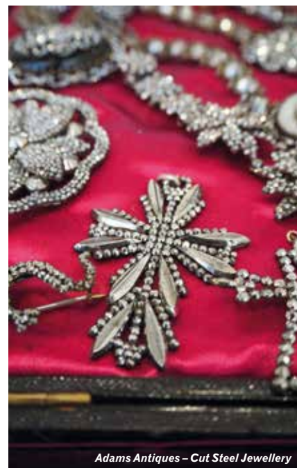
Adams Antiques – Cut Steel Jewellery

of London's most popular entertainment and sports venues and hosts four antiques and collectors fairs annually. The Antiques and Collectors Fair takes place inside the enormous hall pictured here. Dealers have ample space to display hand-picked, quality items. They offer a wide range of genuine vintage and antique goods. In recent years this fair also features 'Pop Up Vintage Fairs' which bring a fresh, younger audience to bric-a-brac and antique shopping. Comb through the Pop Up stalls with its mix of vintage ladies' & menswear, jewellery and accessories, retro homeware together with mid-century collectables and curios. Find yourself immersed in learning about period ceramics sold by knowledgeable dealers. Oodles of stalls sell collections of old sheet music, theatre memorabilia, art books and so much more. ( www.iacf.co.uk/alexandra-palace )