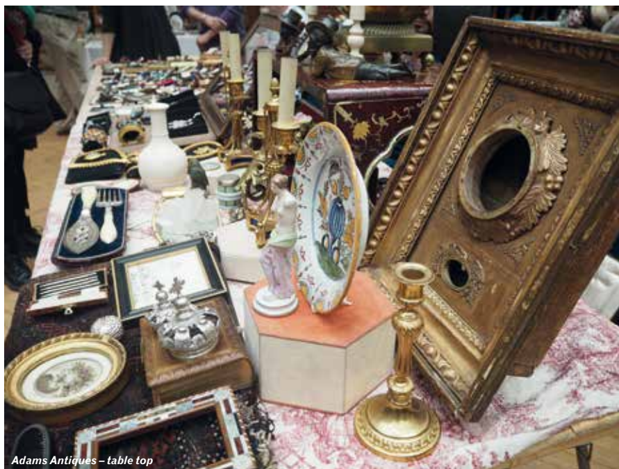
Adams Antiques – table top