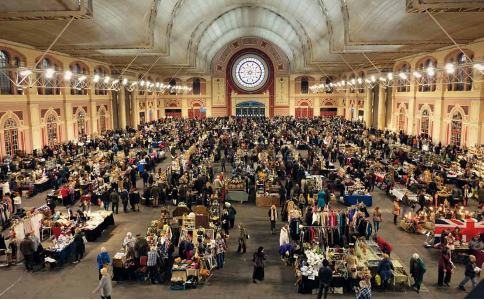
The Great Hall- Alexandra Palace Antiques Fair