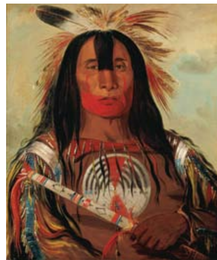
© Stu-mick-o-sucks, Buffalo Bulls Back Fat, Head Chief, Blood Tribe Blackfoot/Kainai , by George Catlin, 1832.

Among the 26 small oil sketches (approximately 12.5" in New York State x 20") and two