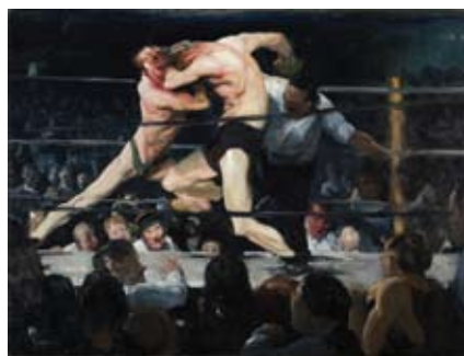
© George Bellows. Stag at Sharkey's, 1909 .

The National Portrait Gallery is privileged to be able to host an exhibition of George Catlin's series of American Indian Portraits (aka Native Americans or First Nations). Catlin (1796-1872) was born in rural Pennsylvania and had ambitions to be an ethnographer, a geologist and a painter. He began his artistic career as a painter of miniatures, but with the passage of the Indian Removal Act of 1830 he felt a sense of urgency to document the lives of indigenous peoples, Native Americans, because they represented a vanishing way of life. They were, he felt, a crucial feature of American 'national art'. He made five trips to the Western frontier regions of the United States in the 1830s where he painted several portraits of American Indians and recorded their manners and customs. Pictured here is Stu-mick-o-sucks, Buffalo Bull's Back Fat, Head Chief, Blood Tribe , whom Catlin found on his trip in 1832 to the mouth of the Yellowstone River. The Blackfoot chief sat for him. It is said that this Plains warrior image contributed to stereotypical representations for all American Indians, an image which has endured to this day. This painting together, with over