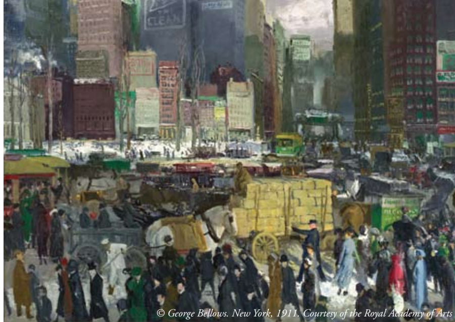
© George Bellows. New York, 1911 . Courtesy of the Royal Academy of Arts

This spring, four of London's major galleries are exhibiting a remarkably diverse array of American artists' work. You will find American Indian Portraits by George Catlin at the National Portrait Gallery, Frederic Edwin Church's Landscape Oil Sketches at the National Gallery, George Bellows: An American Realist at the Royal Academy of Arts and Roy Lichtenstein: A Retrospective at Tate Modern. Whatever your taste in art, you can easily satisfy your interest and curiosity by heading out to view the innovative work by these exceptional artists. Catlin's portraits documented the Native American peoples in the 1830s. Church's magical mid-19th-century landscapes are a vivid record of nature's wonders. Bellows, a leading member