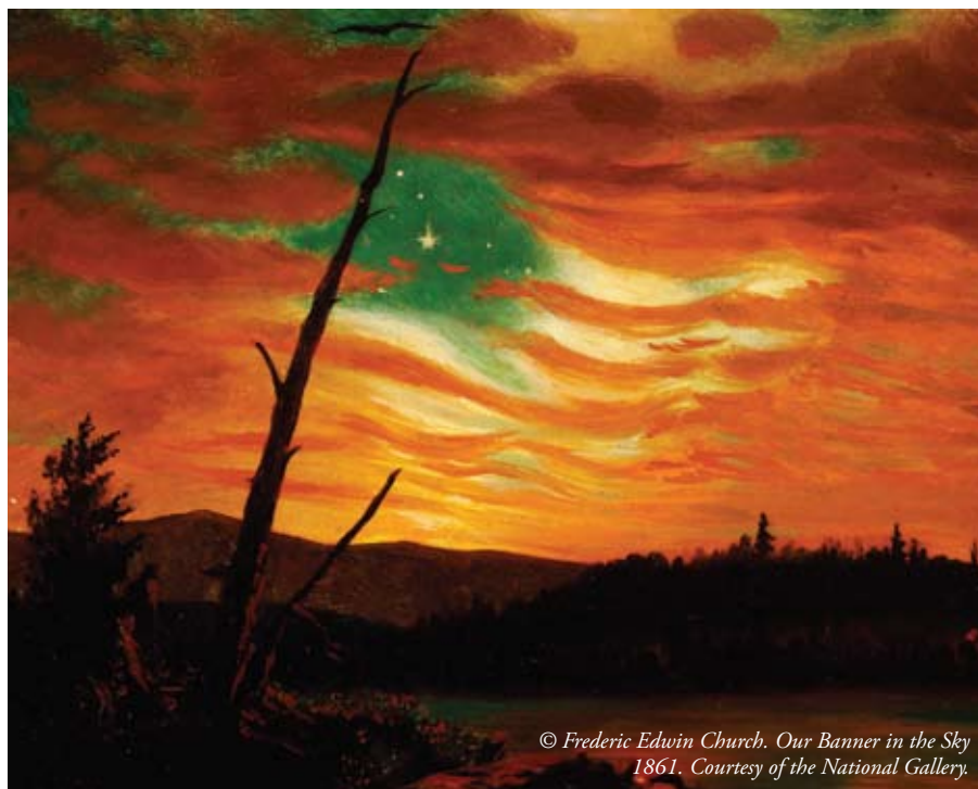
© Frederic Edwin Church. Our Banner in the Sky 1861.

2. Frederic Church and The Landscape Oil Sketch. Wilton, A. National Gallery Company, London 2013